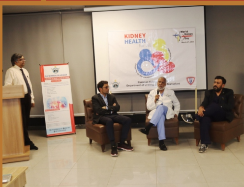
World Kidney Day 2023