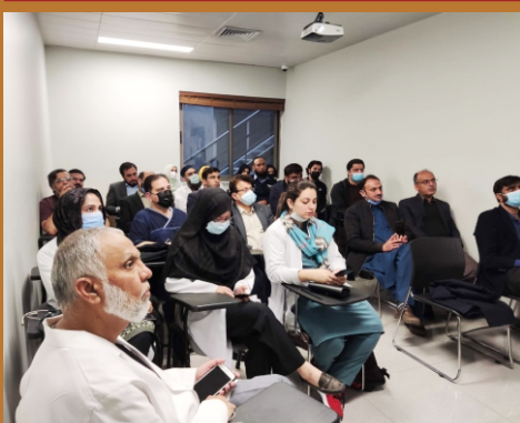
Academic Session in progress