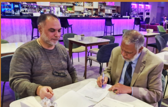
Signing MOU with SAMS for Turkiye/Syria Earthquake Relief