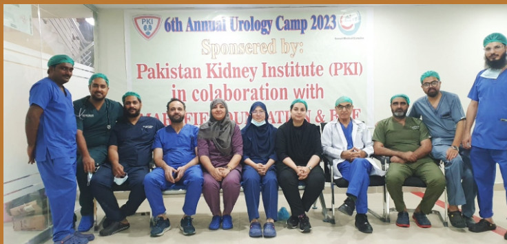
Free Medical Camp Skardu - 2023