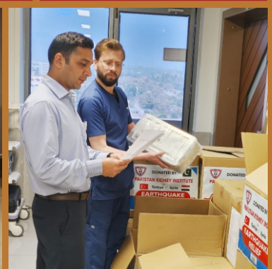
Turkiye/Syria Earthquake Relief 2023-24