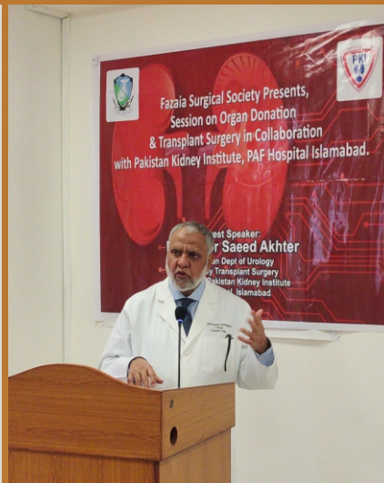
Organ Donation Awareness Campaign