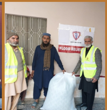
PKI flood relief mission 2022-23